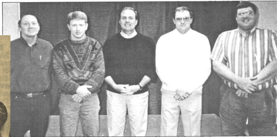
2000 Board Supervisors