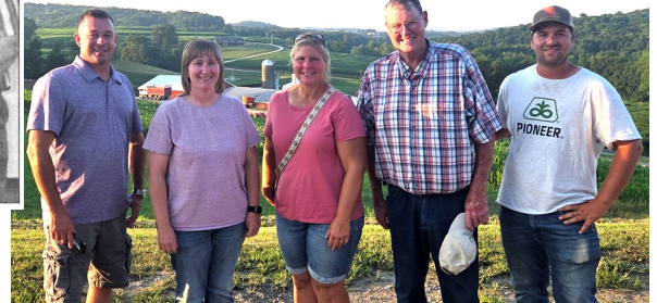
2025 Current Board Supervisors