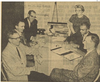
1964 Board Supervisors

You do not have to attend the Annual Meeting and Banquet to participate in the Supervisor Election on October 16 . Voting options are listed in the Election of Supervisor article of this newsletter.