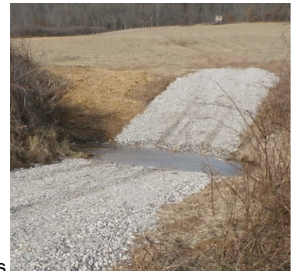
Stream Crossing Planned, Designed and Installed