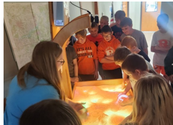
Earth Day at Wills Creek Dam