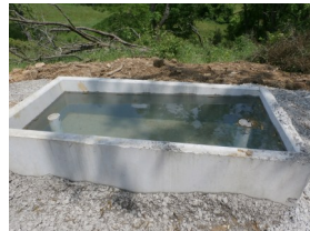
Completed Spring Development Watering Facility