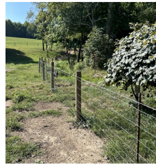
Newly Installed Livestock Fencing