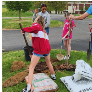
Arbor Day, 330 Tree Seedlings Went to Students at Local Schools