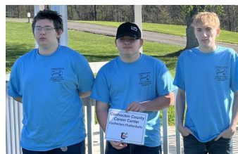
CCCC Natural Resources Chatterbaits