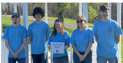
CCCC Natural Resources Big Oaks

We extend our congratulations and best wishes to the top five teams as they prepare to compete at the Ohio Envirothon. Good luck, and continue making your communities proud with your passion for the environment!