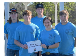
RV FFA Blue

Five teams of students from River View High School and the Coshocton County Career Center traveled to Monroe County to participate in the Area 3 Envirothon, held at the scenic Shadow Lake RV Park on April 23rd. The Envirothon is an annual environmental education competition that challenges high school teams to apply their knowledge of natural resources in a series of hands-on field tests. The event brought together 44 teams from schools across the region to test their knowledge in forestry, wildlife, soils, aquatic ecology, and a current environmental issue.