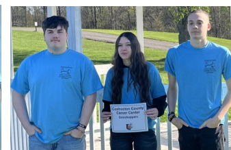
CCCC Natural Resources Grasshoppers