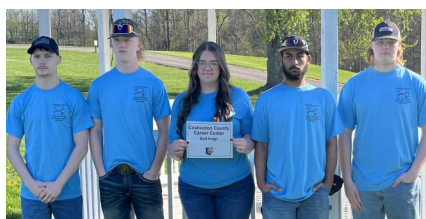
CCCC Natural Resources Bull Frogs