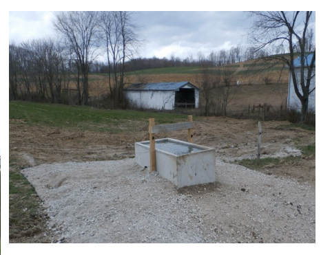
Newly installed watering facility and heavy use area protection

Division fencing installed for a grazing system