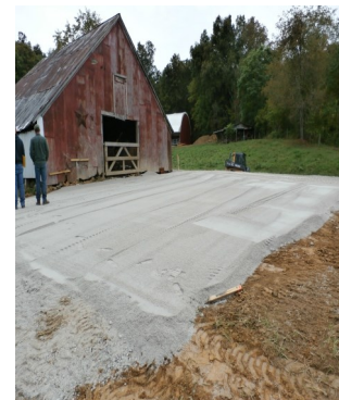
Limestone placed for a winter feeding pad for cattle

Newly installed pressure pipeline for water distribution