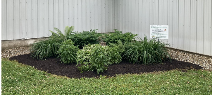
Coshocton SWCD Rain Garden located at the north-east corner of the Agricultural Building