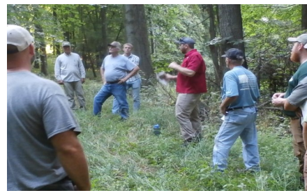
Forestry Field Day