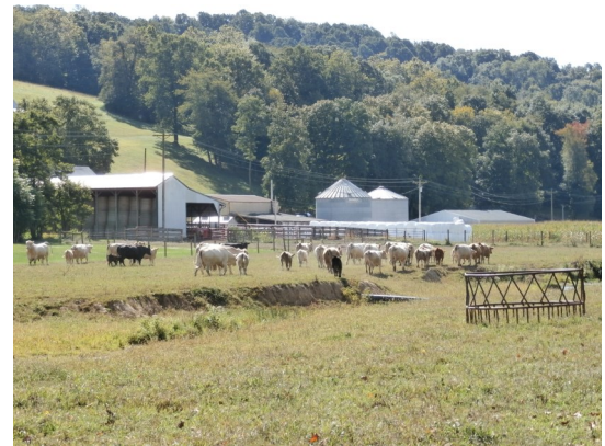
Blair Farms, winner of the Big Tree Contest, was also the farm used for the Mystery Photo Contest