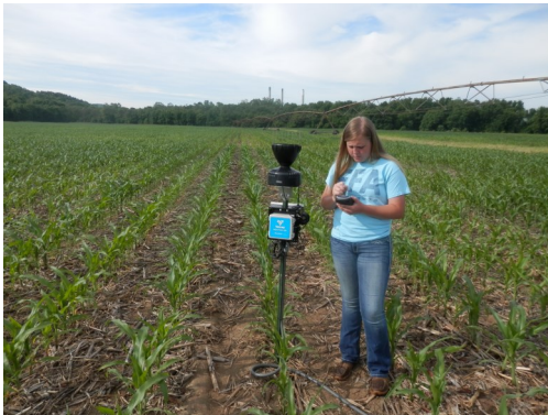
GPS equipment is used to mark the location of a soil moisture sensor