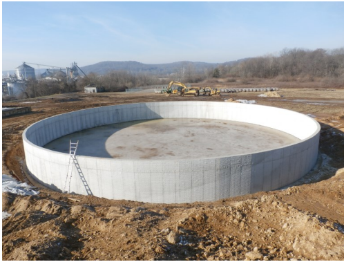
Concrete animal waste storage tank

We thank you for your interest and support of our program and ask that you continue to work with us to wisely use our natural resources.