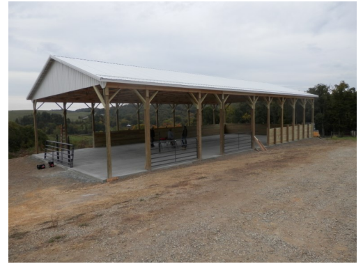
Concrete and wood waste storage structure