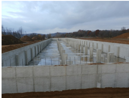
Under-floor manure storage