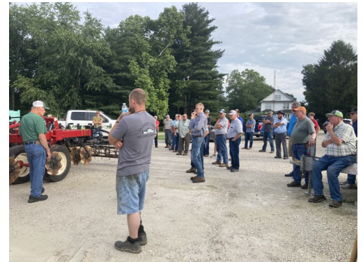
Cover Crop Walks educate landowners on cover crop management