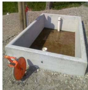
Recently installed watering facility for livestock