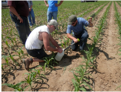
Installing soil moisture probe for irrigation