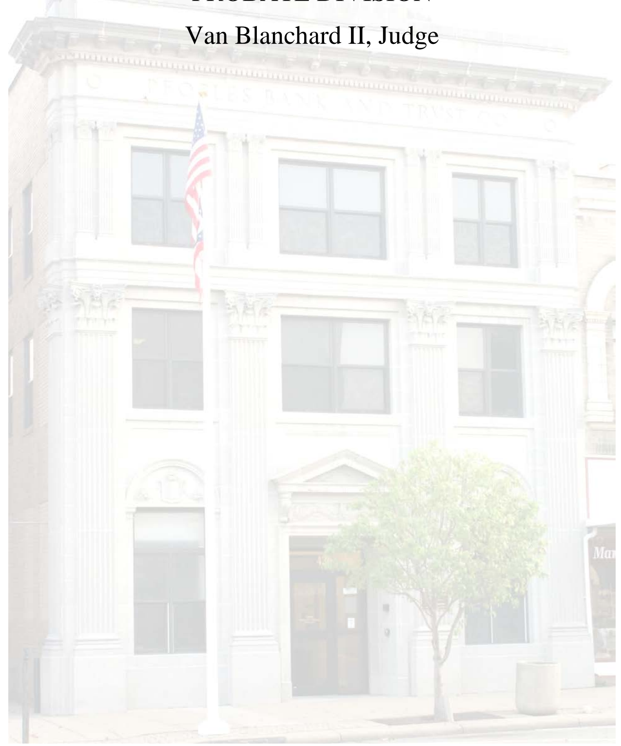
Amended & Updated May 1, 2019