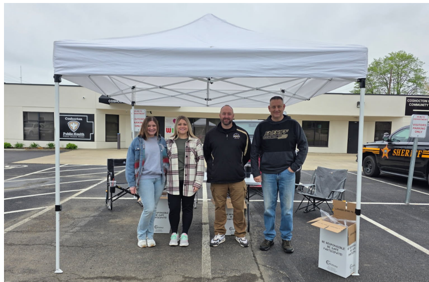
Thanks to the Coshocton County Sheriff's Office, we were able to collect 75lbs of medication during the Drug Take-Back event on 04/26.