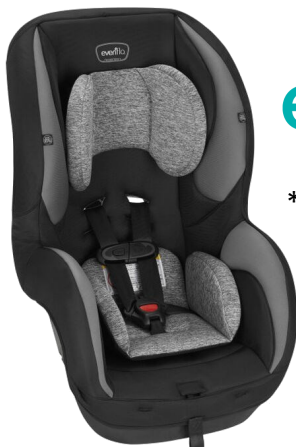
Evenflo® Titan SureRide 65lb Convertible Car Seat*

(An Ohio Child Injury Prevention Program of the Ohio Department of Health)