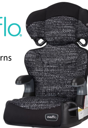
Evenflo® Big Kid Highback Booster Car Seat*

This institution is an equal opportunity provider.