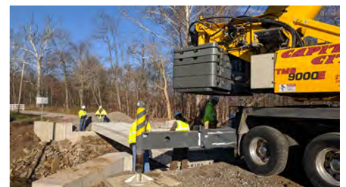
County Road 4, Bridge #6