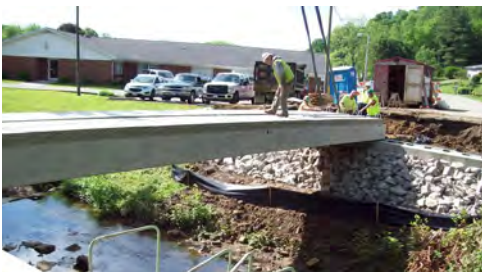
County Road 493, Bridge #1