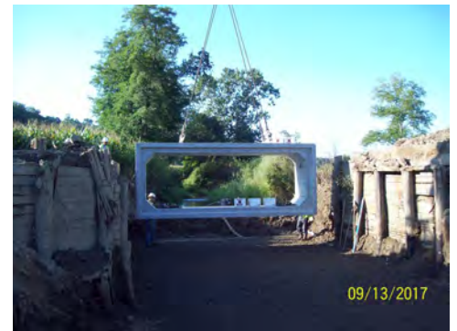
Township Road 65, Bridge #1