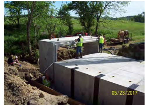
Township Road 161, Bridge #1

The General Appraisal Summary of our bridges is as follows: