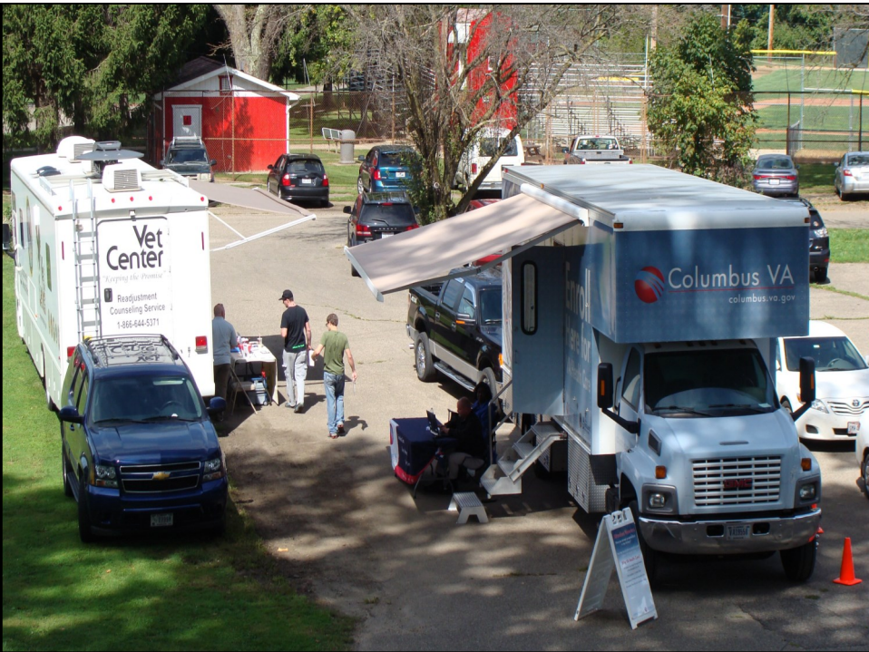
The Stark County Vet Center (left) and the Chalmers P. Wylie Ambulatory Care Center Mobile Health Unit were both on hand during the Coshocton Jobs and Family Services Employment Expo at Lake Park, recently.