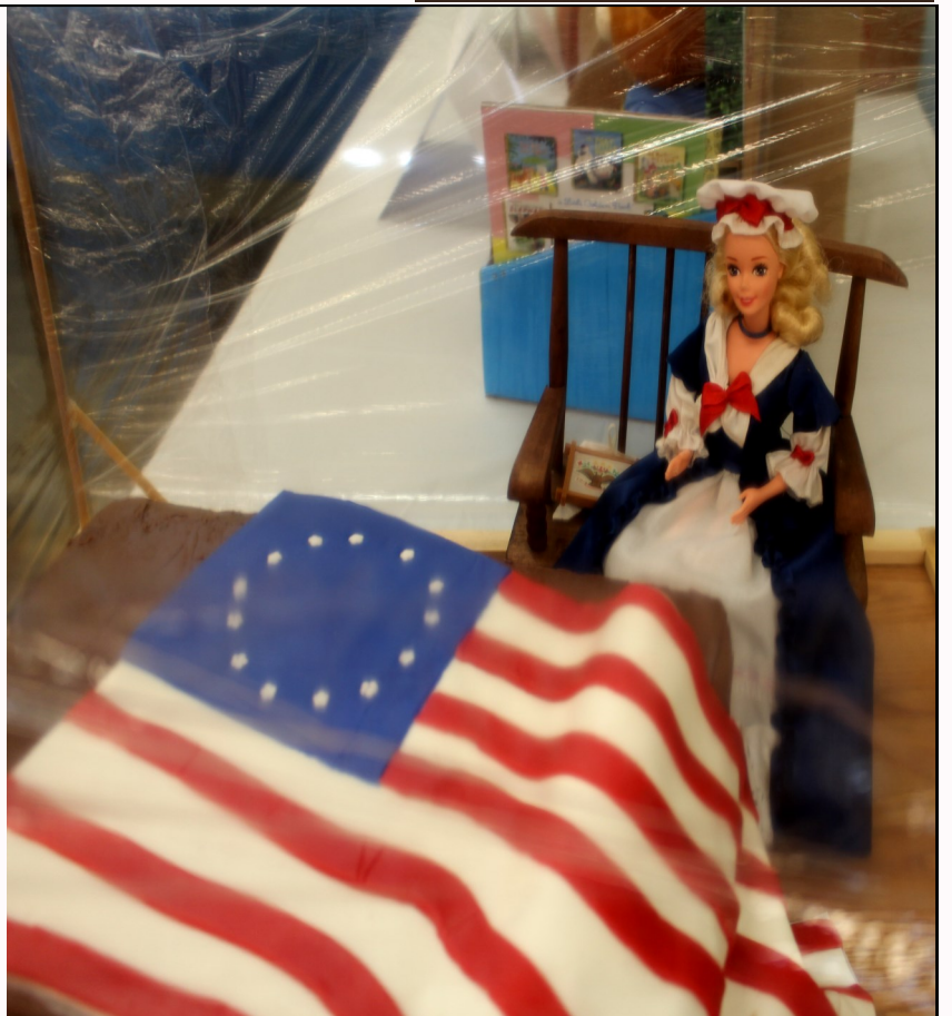
The Coshocton County Veterans Service Office entered this Betsy Ross-themed cake at the recent BPW Cake Auction.