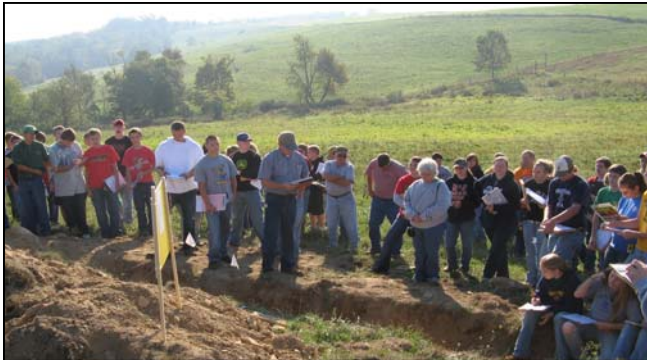
Coshocton Co. hosted the FFA District 8 Soils Judging Contest at the Agricultural Research Service Station on SR 621